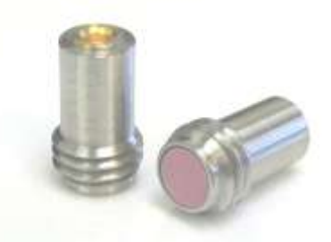
M12 ToFD probes (Half height)