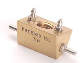
WREN ToFD wedges (Brass)

mainly for use with the WREN Scanner and DTOF & CDTOF Transducers with a reduced land enabling wedges to sit closer to the weld cap