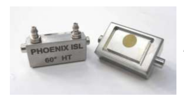
M12 High Temp ToFD wedges (S/Steel)

The material used in this wedge is designed to withstand 200°C, however the temperature limit of the transducer must be considered.